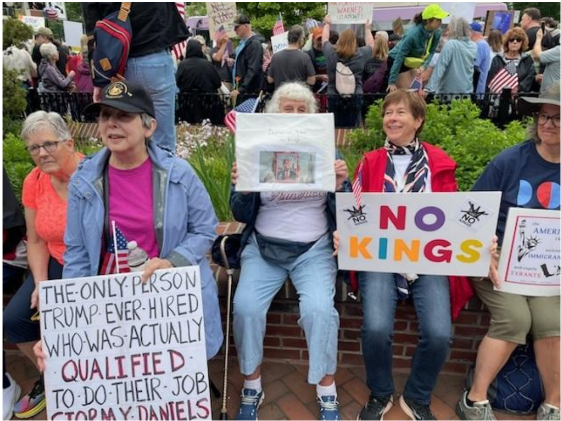
Lots of Willow Valley folks participated.