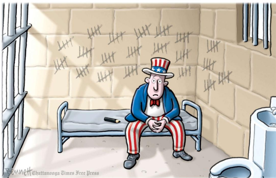
THE FIRST 100 DAYS