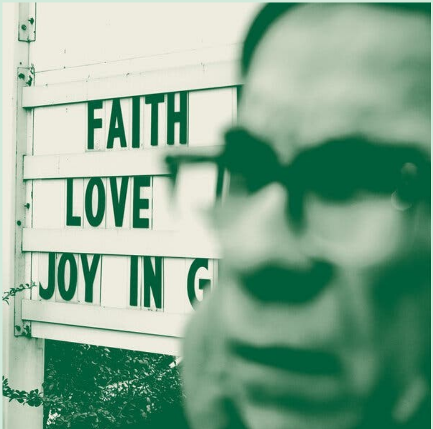
A sign outside of the Water Street Mission shelter in Lancaster, Pa.

When I left Water Street, I just couldn't help feeling how much of a contrast it was to all these other places poor people find themselves. You know, eviction court, parole office, even other homeless shelters often treat people experiencing hardship as numbers, as cases, as burdens. And here's a place that is treating people in their full humanity. It's looking past their hardships, past their addictions, past their homelessness to see people's promise, to see people's beauty. And wouldn't it be amazing if that was the norm instead of the exception.